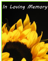
In Loving Memory